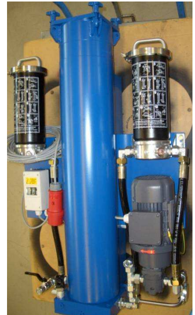
ESP 136 unit