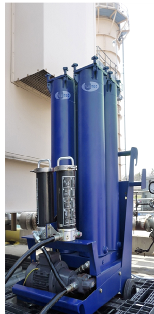
ESP-436 Installed on a GE 7FA Unit –

This Product Information Sheet is Subject to Technical Modifications