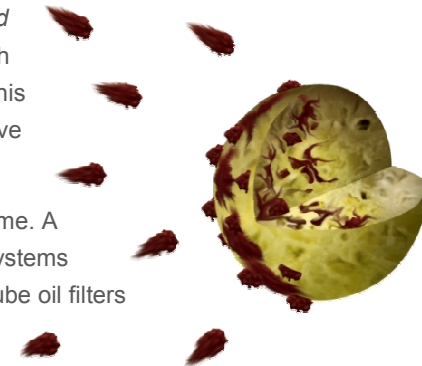
Rapid attraction and retention of varnish-producing contaminants

This means that you will have lower varnish potential numbers in a shorter period of time. A matter of days will typically restore a heavily varnished turbine oil system. The ESP Systems with advanced condition monitoring technologies, on-site plant evaluation, Stat-Free lube oil filters and world-class expertise...finally a proven solution to varnish is at hand.